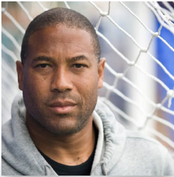
John Barnes, Advocate

John Barnes MBE is a celebrated former professional footballer and one of England's most iconic sporting figures. Born in Kingston, Jamaica, Barnes maintains strong ties to his country of birth while being widely recognized for his contributions to English football, particularly during his decade with Liverpool FC, where he won multiple domestic titles and earned 79 caps for England. Post-retirement, he has served as a coach, commentator, author, and passionate speaker on issues such as racism, identity, and health. Barnes has spoken openly about his family's experience with dementia, including his aunt's diagnosis, and is a vocal supporter of initiatives that raise awareness about the disease and its impact on communities. He has also engaged in conversations around head injuries in sport and their long-term effects. His participation in the WDC Caribbean Dialogue reflects his commitment to giving back to the region and using his platform to advocate for brain health and public awareness.